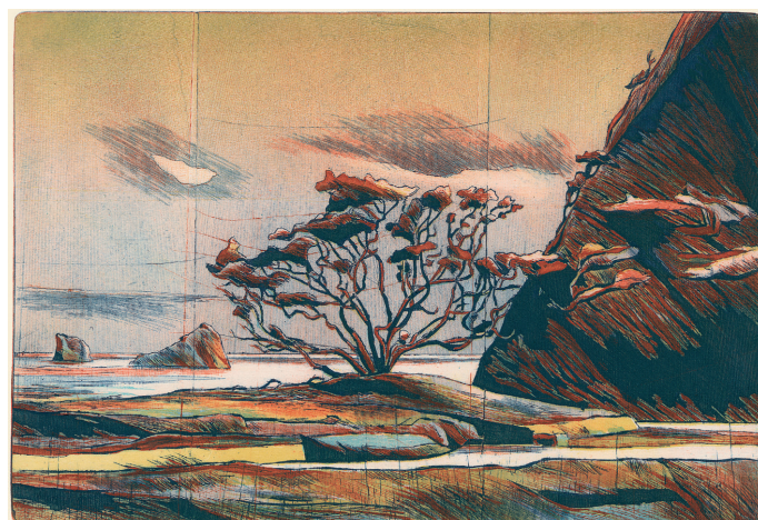
left Stanley Palmer, There ahead was stretched the sandy road with shallow puddles, the same soaking bushes on either side , 1985, two engraved bamboo plates and two zinc lithographic plates, 42 x 62 cm, reversed image right Stanley Palmer, Rakau Tapu , 2010, two engraved bamboo plates and two lithographic plates, 28 x 41 cm

From 1960 to 1980, Palmer focused on printmaking; not only bamboo engravings but also reduction woodcuts. Later, monotypes would come into his oeuvre. At the heart of this period, Kees and Tina Hos opened New Vision Gallery in central Auckland, which fostered artists' prints, sculpture and craft. I remember the Gallery's print stock in large bins and regular displays on the walls. In 1967, the Print Council of New Zealand (PCNZ) was established along the lines of its Australian counterpart. In fact, Palmer was an early champion of the PCNZ, serving on the original steering committee, and supported its aim to bring print artists around the country into contact with one another through newsletters and an annual touring exhibition; he also exhibited regularly at New Vision (1962-1982). When the PCNZ was founded, there were few dealer gallerists in New Zealand who appreciated autographic prints, being suspicious of their status as 'original' artworks; hence the importance of New Vision Gallery and of the first Print Council exhibition. It was opened by Ursula Hoff at Auckland City Art Gallery and comprised seventy-four works by sixteen participants. Palmer was among these early members as was Mervyn Williams, Pat Hanly and Kees Hos from Auckland, John Drawbridge and Kate Coolahan from Wellington and Barry Cleavin from Christchurch. By the closure of this exhibition, 160 print artists and print patrons had signed up.